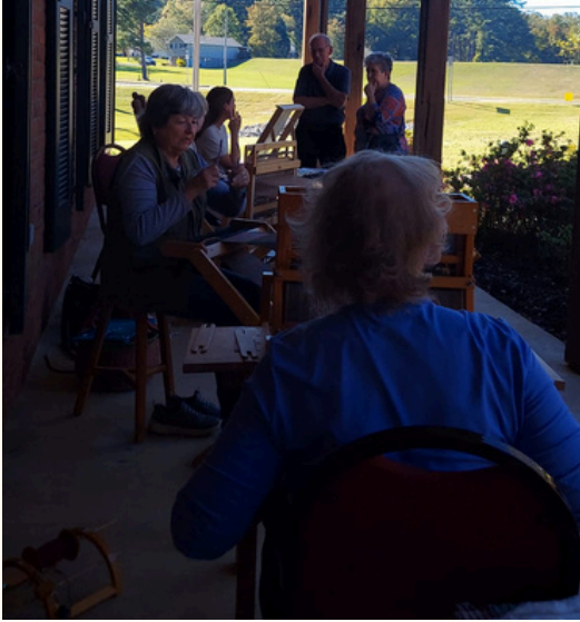
Weaving on the porch of the Clinton Visitors Center.